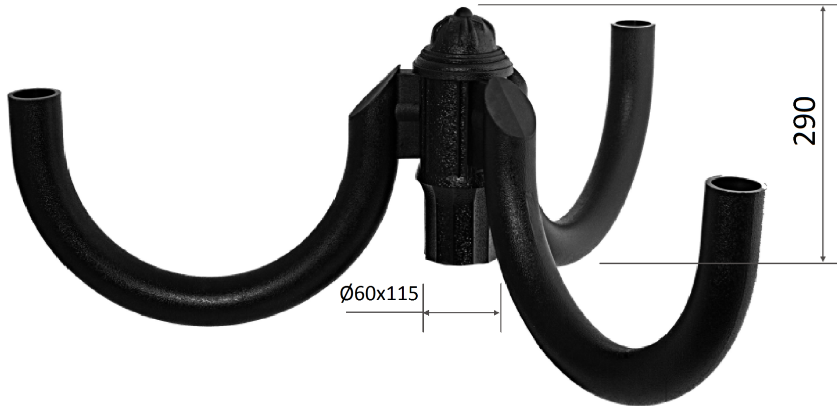
Arm system P „3” upwards